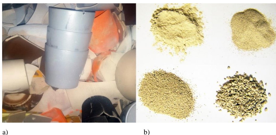
Fig. 1. Post-production ceramic waste (a) crushed ceramics – fractions as in Table 2 (b)